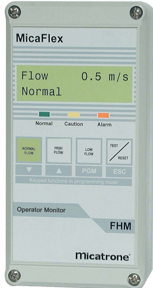
Operator monitor FHM

The system also consists of special dampers with very low friction. These are available as zincified, epoxy painted or stainless steel.